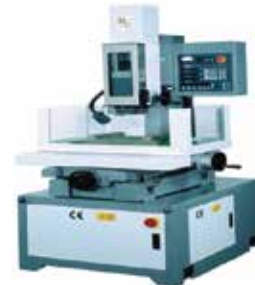
EDM Drilling Machine