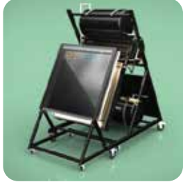
Solar Thermal Training System