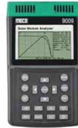
Solar Module Analyzer