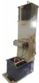
Solar Water Pump Test Rig