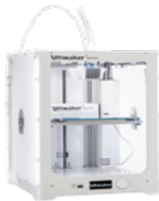
Fused Deposition Modeling (FDM) 3D Printer