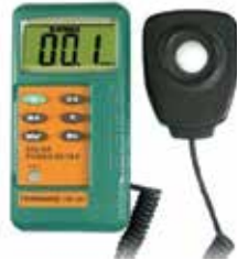
Solar Power Meter